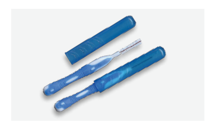
Interproximal Brush Cylinder $0.45 each (72 per box, 2 box minimum) SKU# 755132