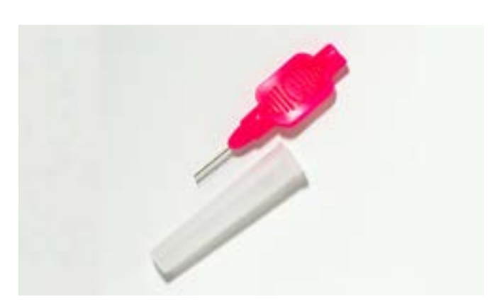
T-Series Interproximal Brushes $0.54 each (72 per box, 3 box minimum) 5 sizes available.