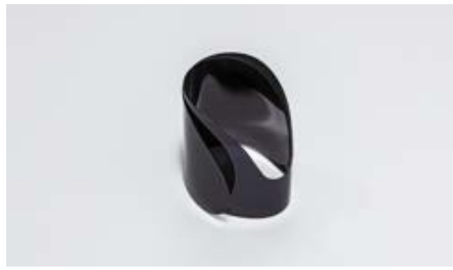
Protect-A-Lens (100 per box) Smoke Disposable Lenses SKU# 901-S