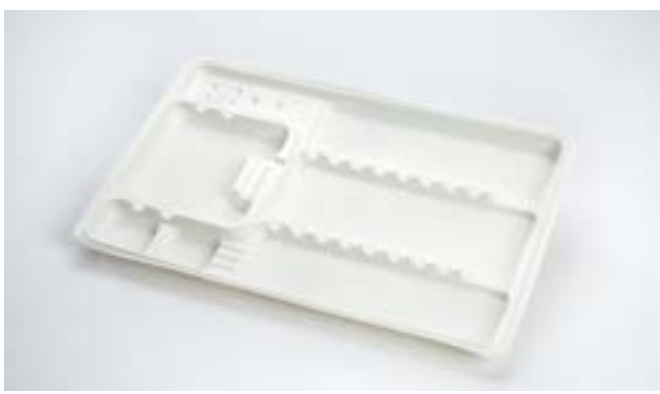
Disposaliner Tray - Medium

The ultimate tray system for modern dental offices. You will appreciate the cost savings—more economical to use than conventional tray systems. Recyclable, high impact polystyrene. 50 trays per pack. Size: 5" x 7".