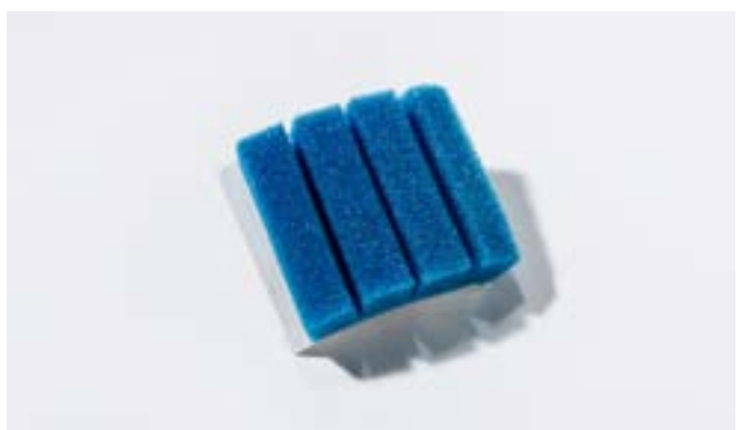
All-Wipe (50 per box) Shop Dealers Disposable Instrument Cleaner SKU# 520