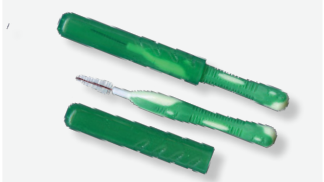
Interproximal Brush Conical $0.45 each (72 per box, 2 box minimum) SKU# 755133