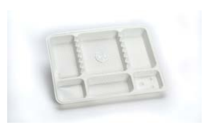
Disposaliner Tray - Small

$11.32/pack (50 per pack, 10 pack minimum)