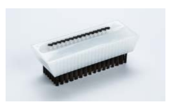
Surgeon's Scrub Brush $3.17 each (12 per box, 4 box minimum) Surgeon's brush with angled nail brush.