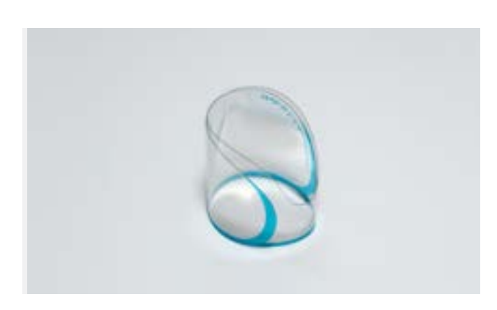
Protect-A-Lens (100 per box) Clear Disposable Lenses SKU# 900-C