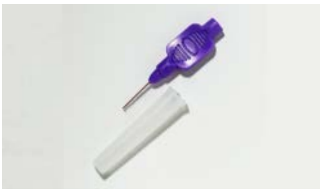
T-Series Interproximal Brushes $0.54 each (72 per box, 3 box minimum) 5 sizes available. SKU# 750911 (Extra Fine-Violet)