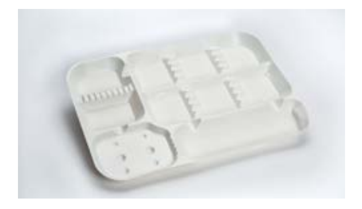
Disposaliner Tray - Large

$19.78/pack (50 per pack, 6 pack minimum)